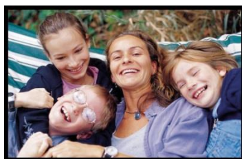
Parent Support Groups